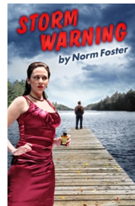
On Aug. 3 to 25, Rose Theatre's Studio space will showcase legendary playwright Norm Foster's Storm Warning. .....

For more information visit www.rosetheatre.ca ( http://www.rosetheatre.ca ) or phone the box office at 905-874-2800.