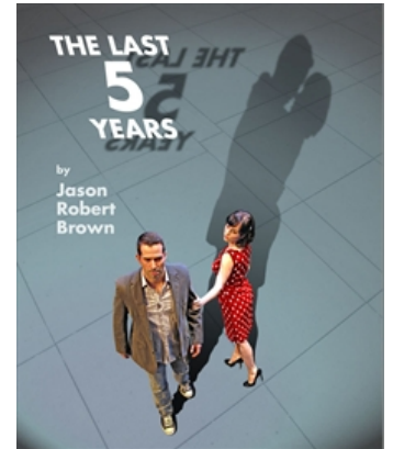
The Rose Theatre's summer season kicks off July 6 with contemporary musical, The Last Five Years . The modern musical written by Tony award-winner Jason Robert Brown takes an introspective look at love.

"The longevity of the Summer Series can be accredited to the city's incredible support for the arts as well as the thirst for excitement in the City of Brampton,"