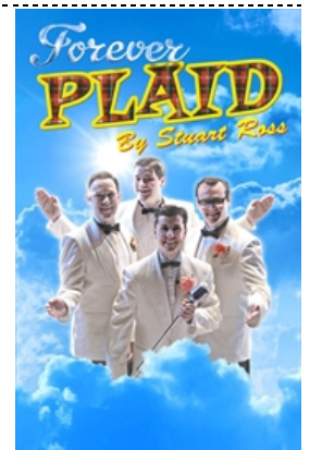
Forever Plaid , a "hilarious and goofy" musical follows four young singers revived from a car crash to perform the show that never was. This show will run July 13 to 28.