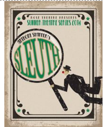
The 2014 Summer Theatre Series at the Rose Theatre presents...