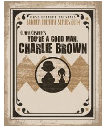
The 2014 Summer Theatre Series at the Rose Theatre presents...

"It's one of these show where the audience will leave talking about it," he said. "People want to see different things and sometimes be surprised (by our programming). This (play) is interesting— and rewarding— to follow from beginning to end."