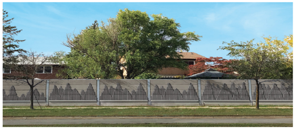
Option 3: medium-tone, warm grey background and darker-tone, neutral grey trees