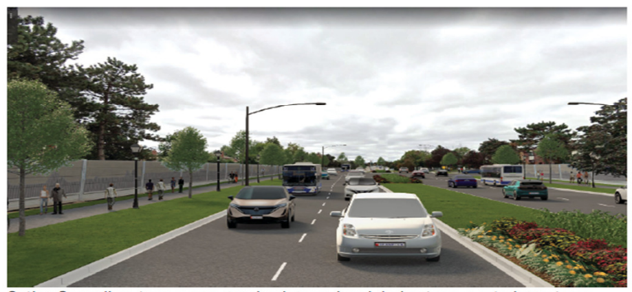
Option 3: medium-tone, warm grey background and darker-tone, neutral grey trees