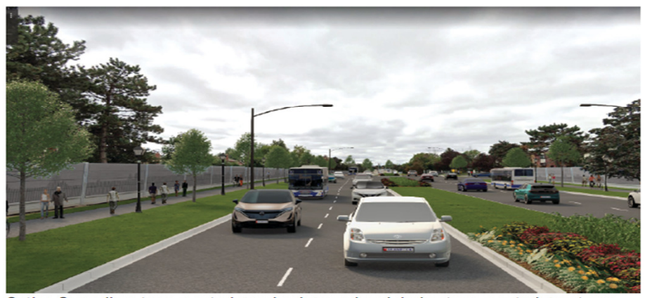
Option 2: medium-tone, neutral grey background and darker-tone, neutral grey trees