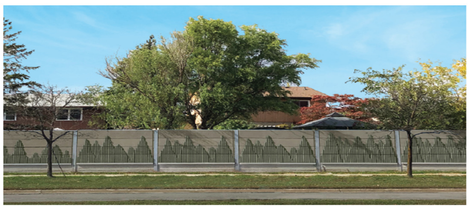
Option 1: medium-tone, warm grey background and darker-tone, neutral green trees