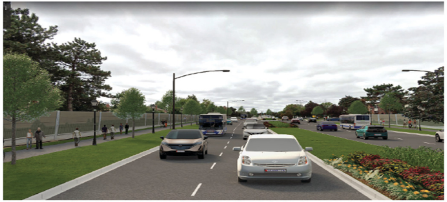
Option 1: medium-tone, warm grey background and darker-tone, neutral green trees