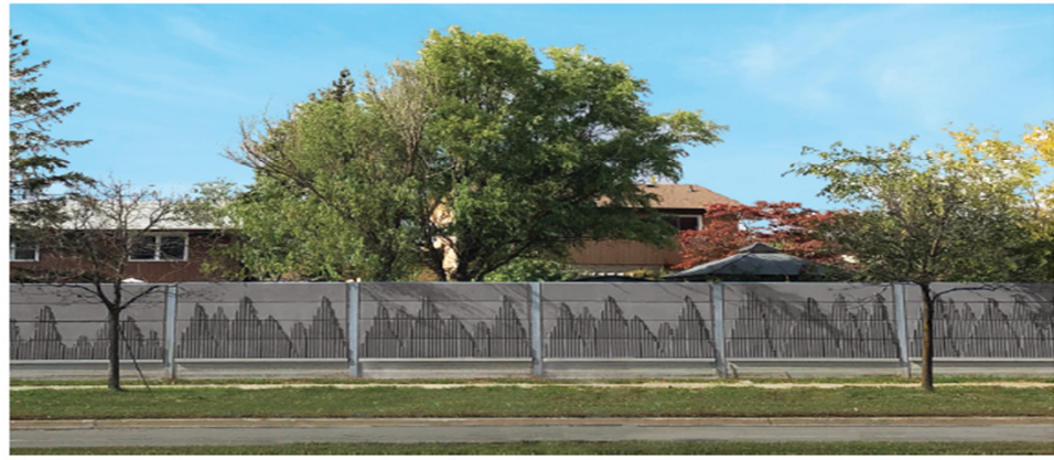
Option 2: medium-tone, neutral grey background and darker-tone, neutral grey trees