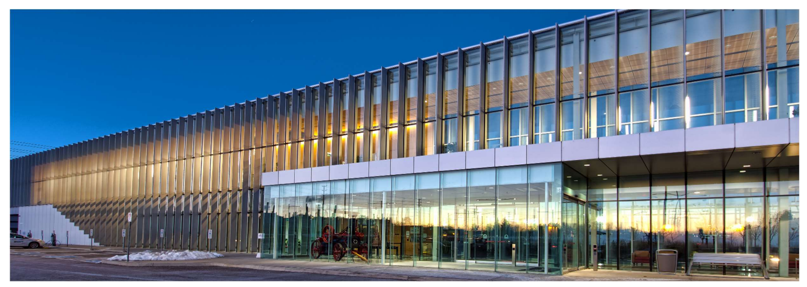
LEED Gold Certified Williams Parkway Operations Centre