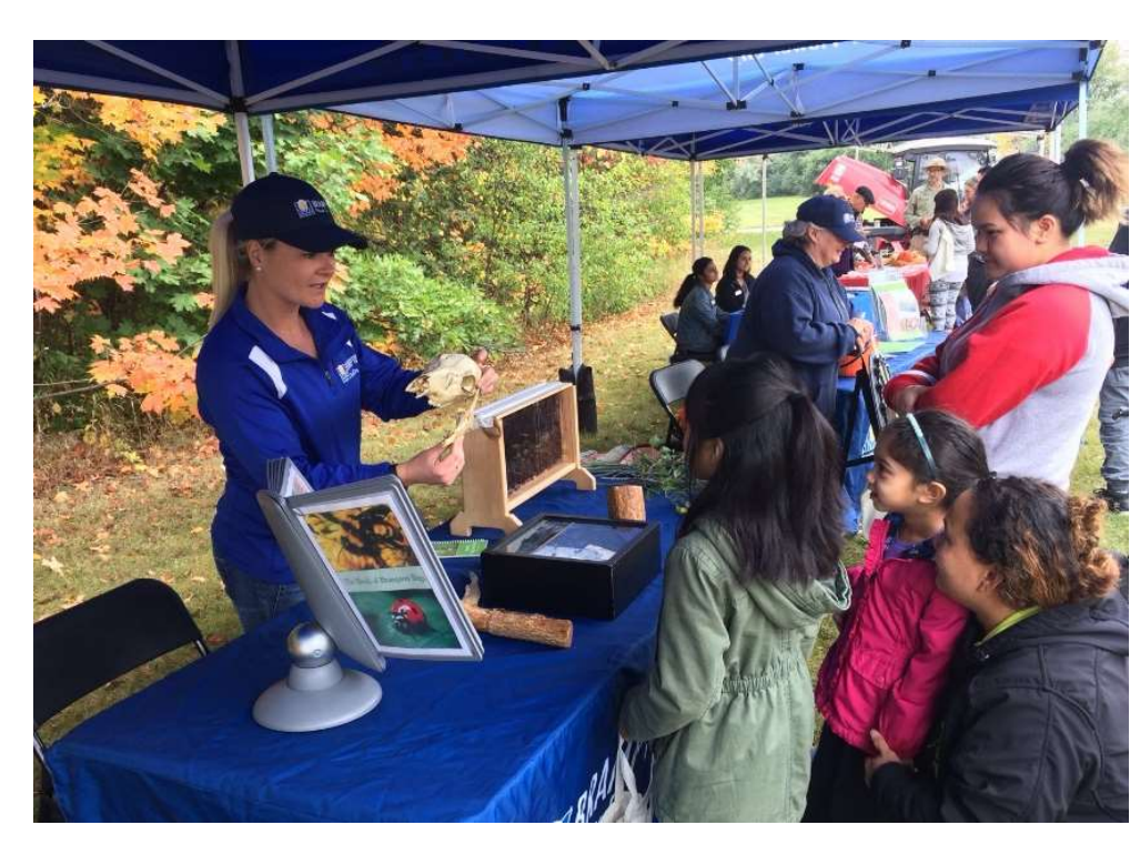
Grow Green Achievements | People 4