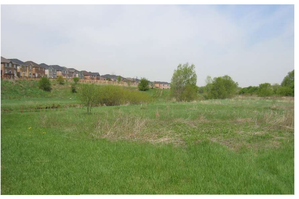
Fletchers Creek Valley: Before Valley Naturalization