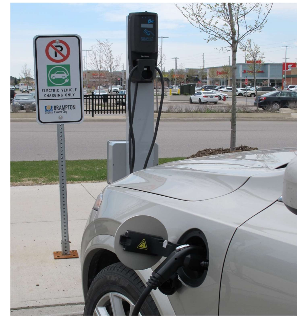
EV charger at Springdale Library