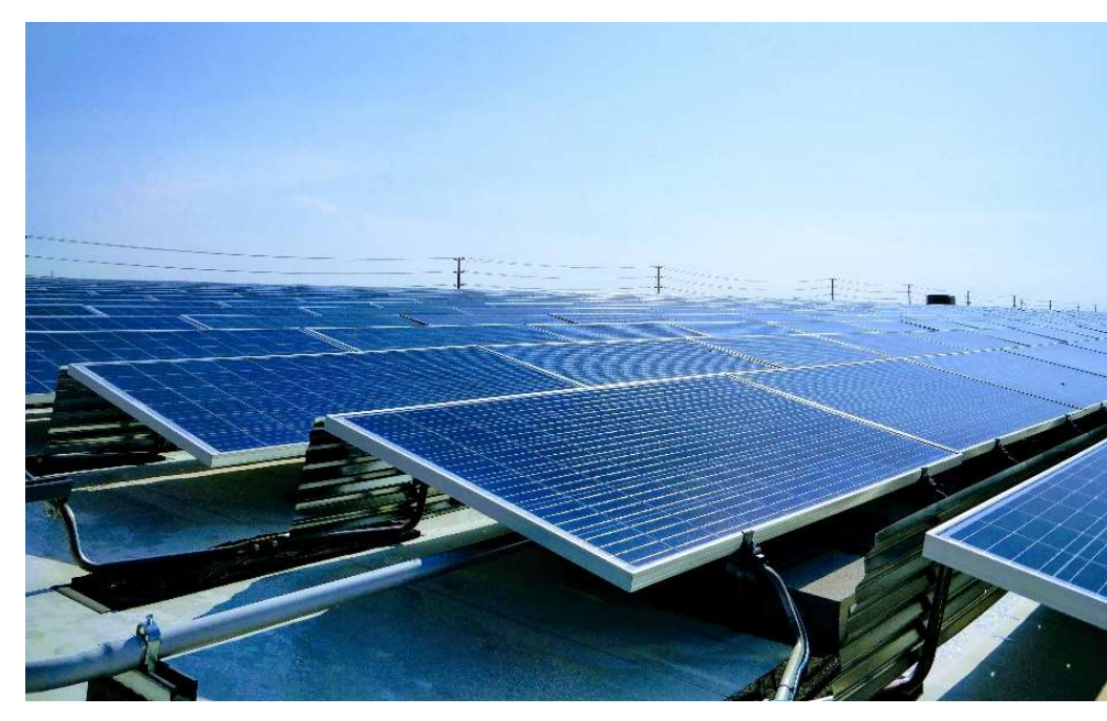
Grow Green Achievement | Energy 4

Between 2014 and 2019 City renewable energy projects produced 11,123,754 ekWh of clean energy.