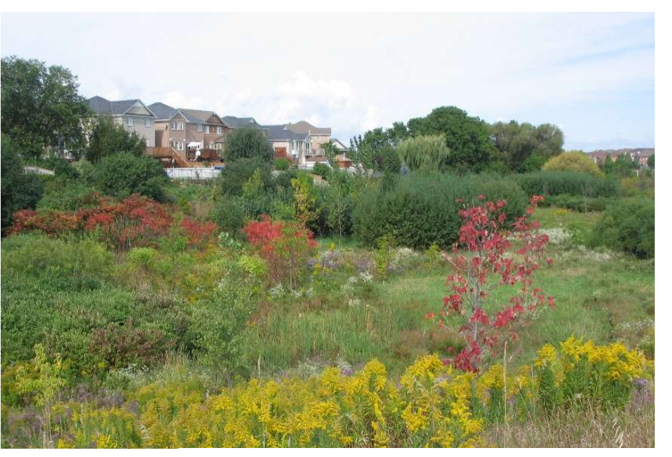
Fletchers Creek Valley: After Valley Naturalization