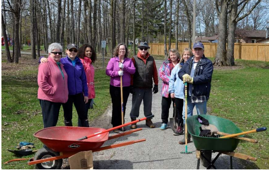
Friends & Stewards of Dorchester Park