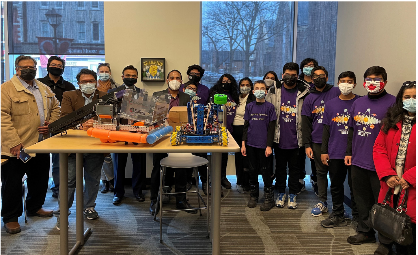
Canada's youngest city fosters innovation and creativity - Robotics competition.