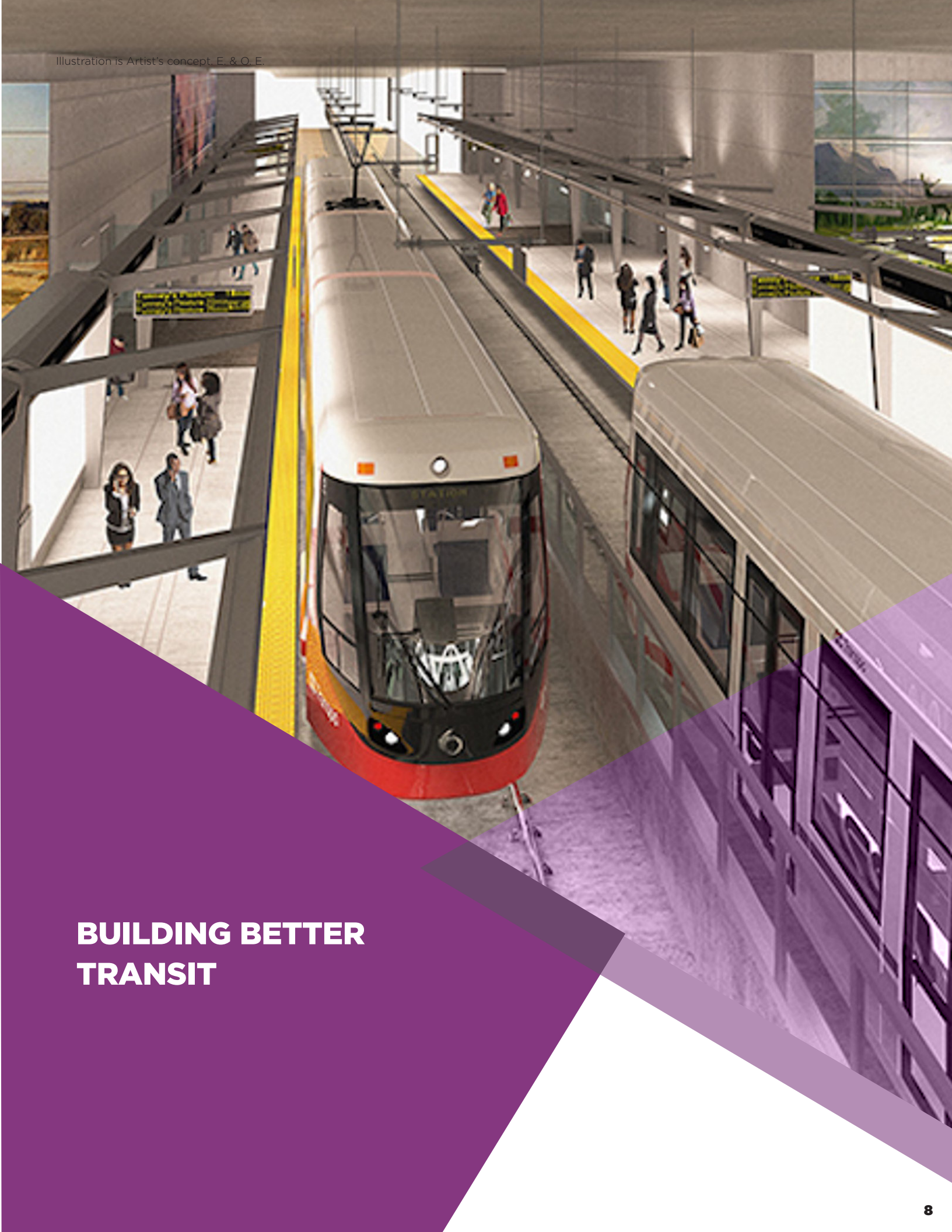
Illustration is Artist's concept. E. & O. E.