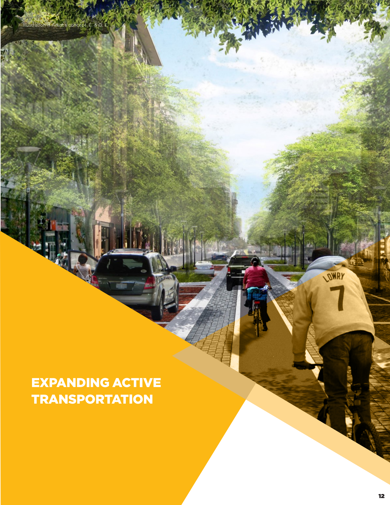
Illustration is Artist's concept. E. & O. E.