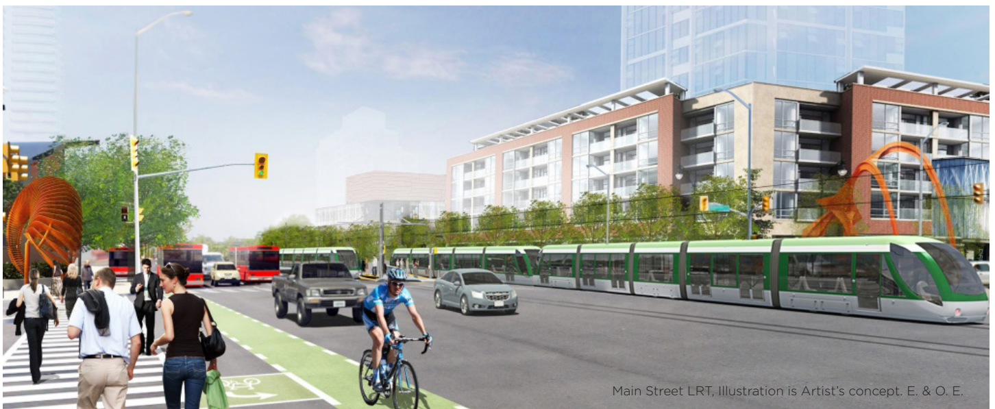
Main Street LRT, Illustration is Artist's concept. E. & O. E.

Allowing a transit system exemption from the $0.1341/L Federal Carbon Tax, will help ease some of the financial pressure which transit systems are feeling with the rising fuel prices now and in the future. Transit systems help reduce greenhouse gas emissions and contribute to a healthier community, which already supports the overall goal of a Carbon Tax.