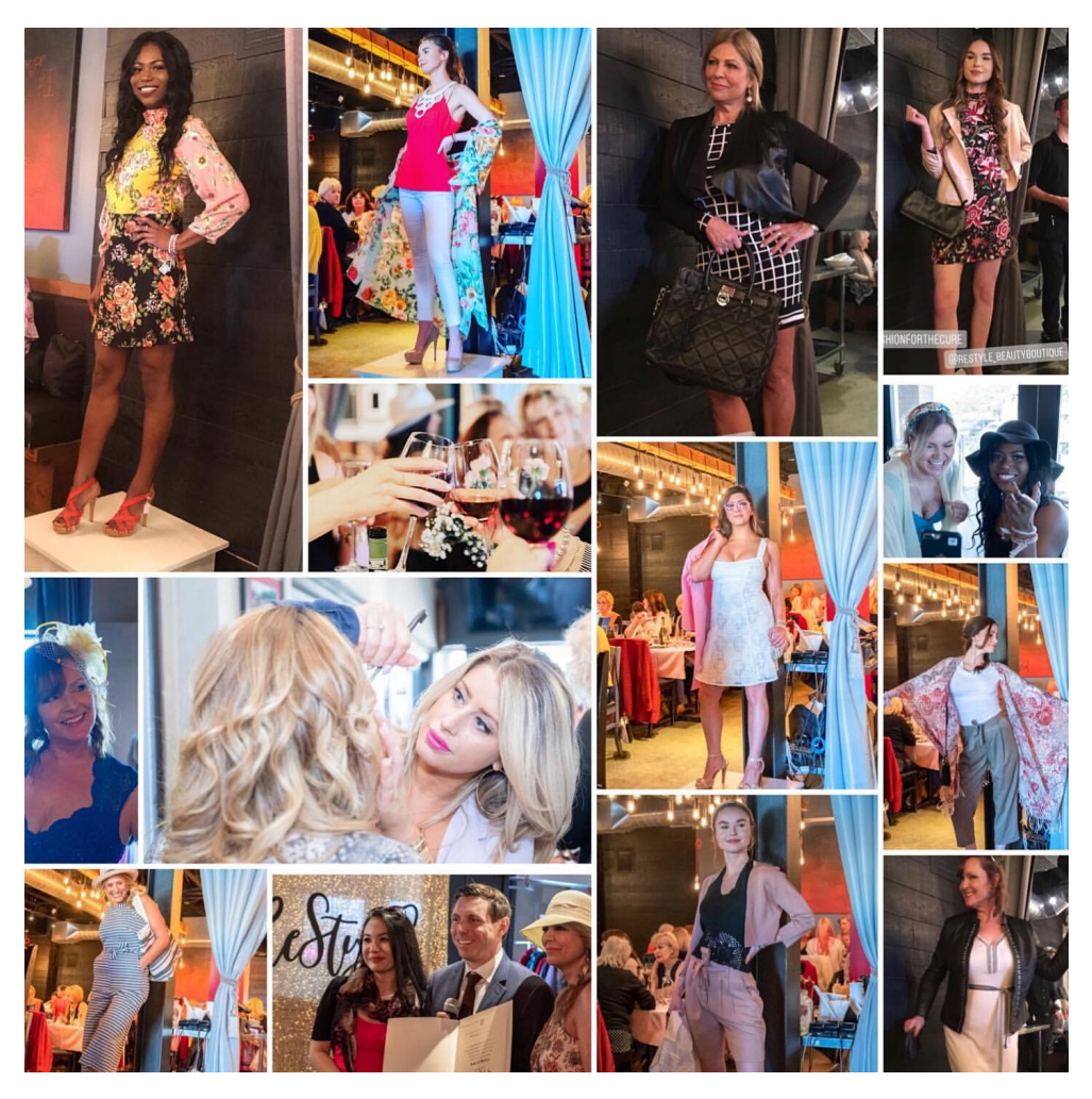
The Restyle Beauty Boutique team at Fashion for The Cure 2020

Their Fashion for The Cure fashion show, through which the Restyle team raises funds for Wellspring Chinguacousy, a local cancer support centre, is just one example of their positive impact on the Brampton community.