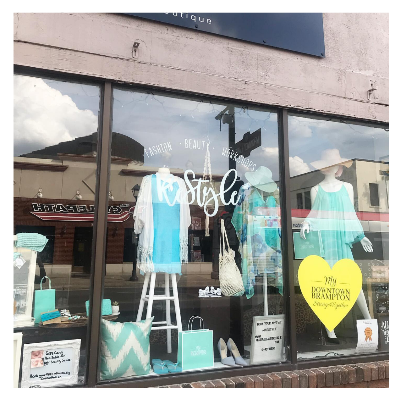
Restyle Beauty Boutique Storefront

Their advice to anyone looking to embark on their own entrepreneurship journey: "as corny as it sounds, JUST DO IT! Of course, do your research and don't be afraid to ask questions because knowledge is power. But at the ends of the day go for it and remember to laugh along the way!"