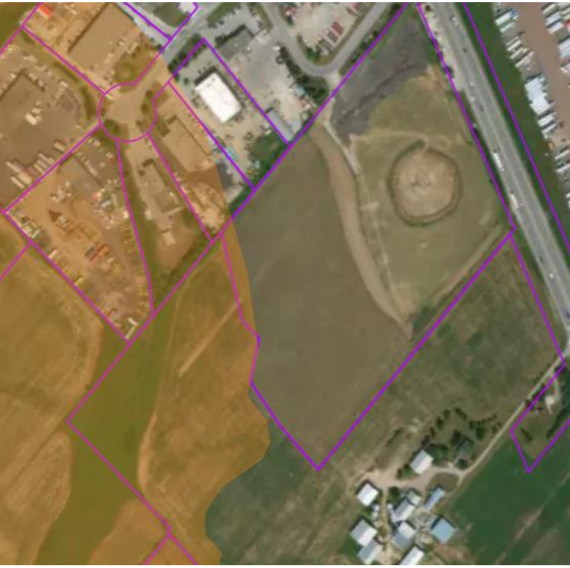
FIGURE 2. TRCA REGULATION MAPPING (2020)

As per the report written by SLR Consulting for the Huntington Road Part A and Part B Langstaff Road to Nashville Road Schedule 'C' Environmental Assessment (2017) a study area adjacent to Huntington Road downstream of the proposed Brampton Transit Facility Property: