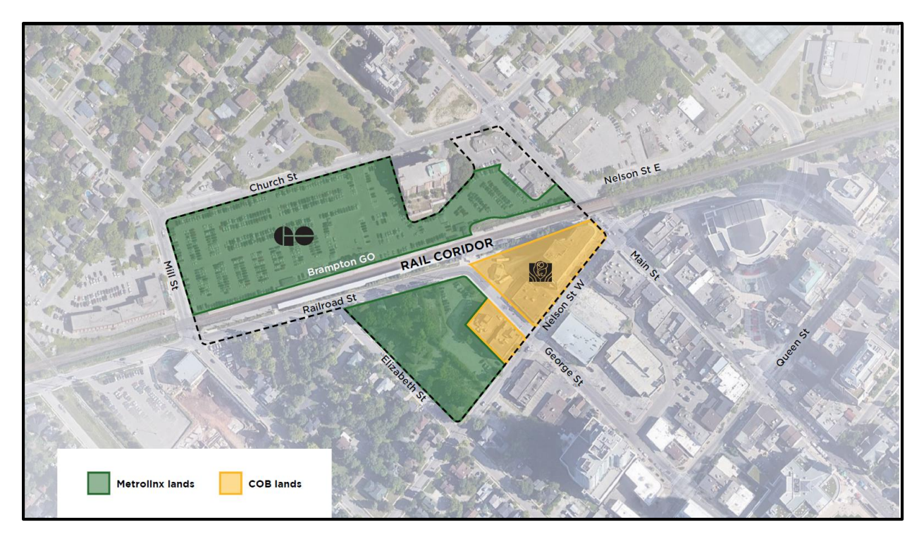
Figure 1: Downtown Transit Hub preliminary Study Area

The graphic in attached Appendix-1 shows key higher order transit projects and initiatives currently under consideration through various plans and studies in addition to the current transit services that will connect the downtown Brampton – as can be seen, the Downtown Transit Hub is a key piece of infrastructure linking regional and local transit services and the following higher order transit project and initiatives: