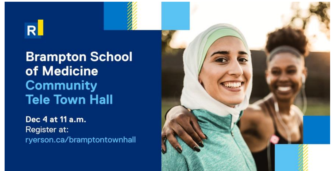
Establishing a Brampton School of Medicine