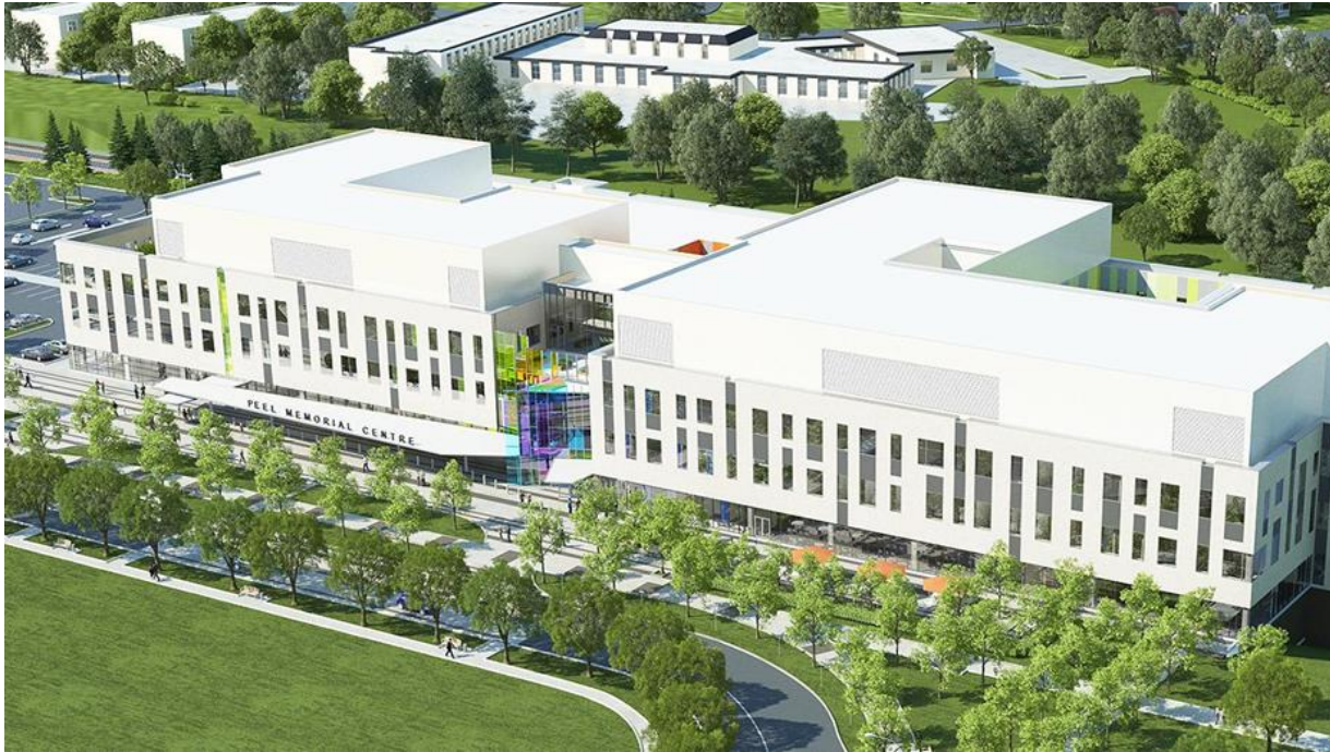
Speedy approvals for new Peel Memorial hospital