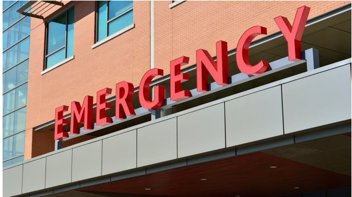
Funding for a 3rd full-service hospital