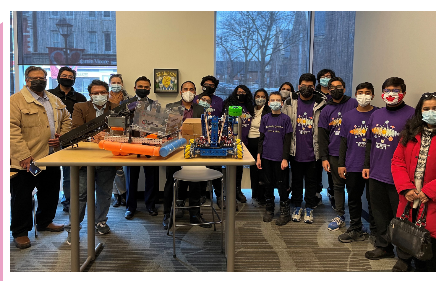
Canada's youngest city fosters innovation and creativity - Robotics competition.