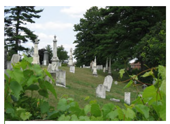
Figure 9: Cemetery in Brampton