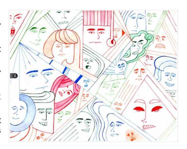
Figure 7: "Connections" by Mariam Al-Ehamed at Expressions of Youth in Peel exhibition at PAMA