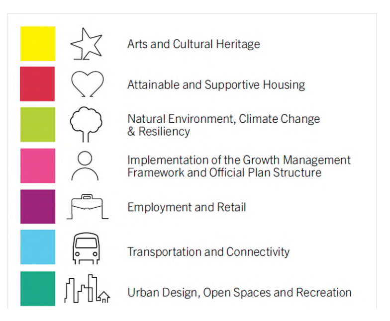
Focus Areas of the Official Plan Review

A component of Brampton Plan project involves studying issues in more detail, as identified through the work on the 2040 Vision, or identified through engagement with Council, stakeholders, and the public. To ensure these issues are appropriately addressed considered through the development of policy, seven Discussion Papers are being prepared, which generally align with the themes and findings of the Brampton 2040 Vision. These Discussion Papers are noted below and represent a starting point for generating discussion about general policy issues that will be addressed in subsequent phases of the Brampton Plan Project. Brampton Plan comprises five phases. with multiple opportunities for residents to engage with the City and shape the future of Brampton's growth.