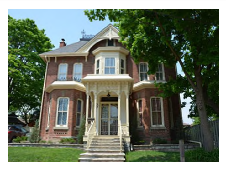
Figure 8: Built Heritage Resource Sample in Brampton