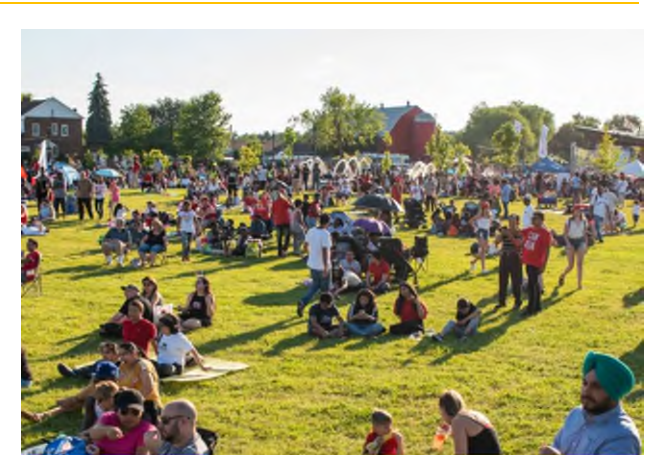
Figure 5: Cultural Celebration in Brampton

The City works with the creative community to put on annual events for residents and visitors alike and focuses on promoting creative talent by showcasing local and national artists on our stages. These event activities are produced by Brampton-based community groups, and local food vendors featuring an array of global flavours.