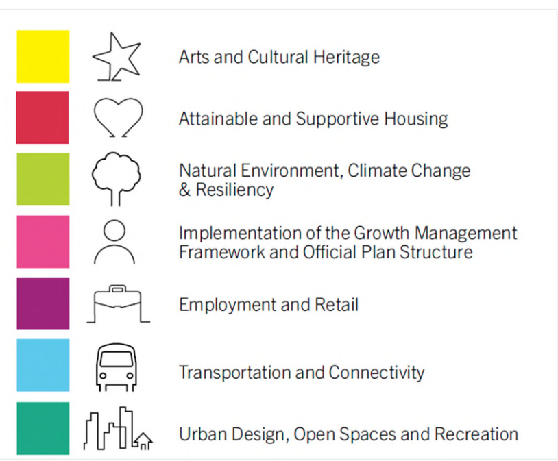
Figure 2: Focus Areas of the Official Plan Review

While there are seven specific Discussion Papers, the themes within each paper are not exclusive and often connect with concepts or ideas discussed in another paper. These papers are also written with accessibility, sustainability diversity. inclusion lenses to ensure the recommendations policy prepared taking into account multiple perspectives and to raise awareness related to economical issues impacting City of Brampton residents.