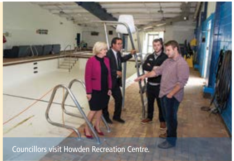
Councillors visit Howden Recreation Centre.

Are you a senior or someone living with a permanent disability? If so, the City can help cover the cost of hiring someone to clear your snow. If you qualify, you can receive up to $200 for a non-corner lot, or $300 for a corner lot with sidewalks on two sides (if neither one is cleared by the City). Visit www.brampton.ca/snowgrant to learn more and find out how to apply.