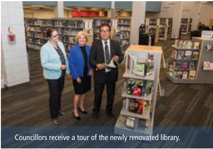
Councillors receive a tour of the newly renovated library.