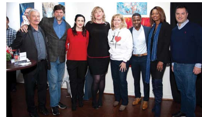
Beaux Arts Brampton's Cupid Strikes Fundraiser (February 2018)