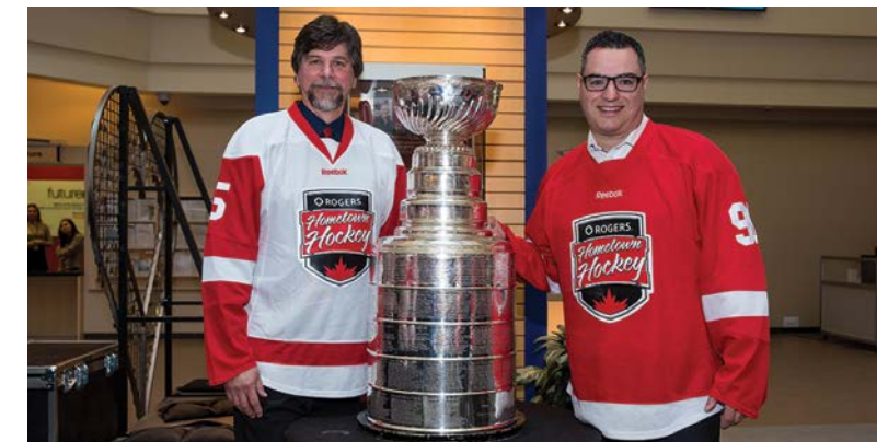
Hometown Hockey, (March 2018)

As your Regional and City Councillors for Wards 3 & 4, we look towards a bright future where we will continue to work together to build a healthy and safe community for our residents, where accountability and transparency are a priority as you are valued and respected taxpayers. Job creation, efficient transit systems, more hospital beds, and community safety will remain our top priorities.