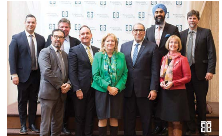
State of the City Luncheon, (February 2018)