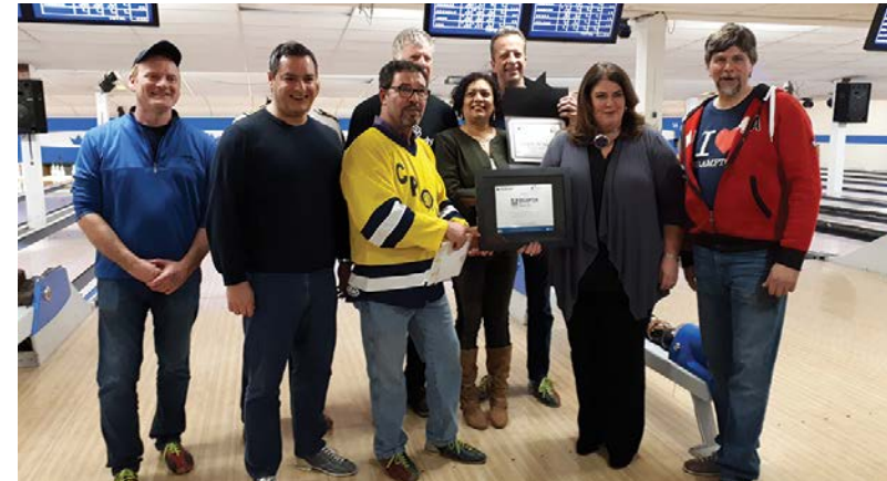
Big Brothers Big Sisters Bowling for Kids Sake Fundraiser, (March 2018)