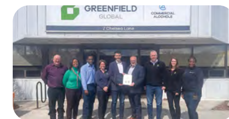
30th anniversary celebration of Greenfield Global. An amazing company with a global reach right here in Brampton.