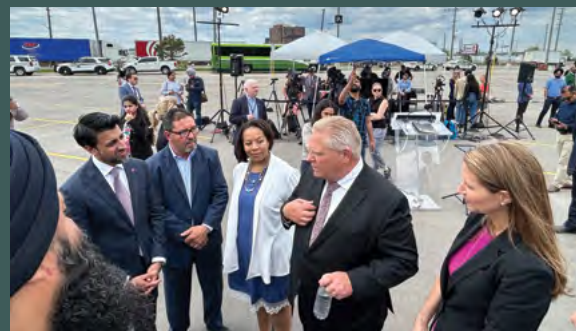
The provincial government unveiled new upgrades to the Bramalea GO Station, supporting future two-way, all-day GO train service along the Kitchener line.