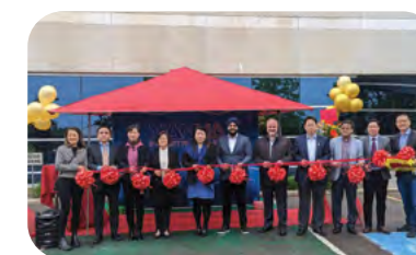
Ribbon cutting celebration of GM Logistics and Real Estate Solutions Centre investment in Brampton.