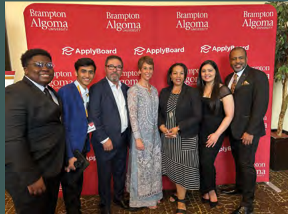
I was proud to attend and support Algoma University's inaugural gala that raised $50,000 to support a new scholarship for equity-deserving students. The event celebrated the university's tremendous development within the City of Brampton (May 2023).