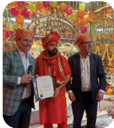
Attending the special 34th annual Baba Balak Nath Ji Challa ceremony with Mayor Patrick Brown and the Hindu community (April 2023).