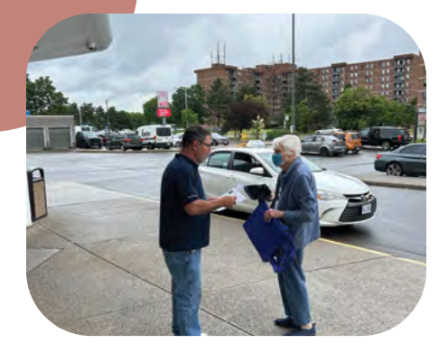
Distributing information to members of the public about a community meeting for a development proposal in the