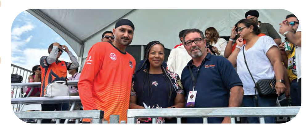
I had the honour of meeting Harbhajan Singh – an international cricket superstar and sports commentator - during the Global T20 Cricket tournament in Brampton. This was a blockbuster event featuring the biggest cricket players (July 2023).