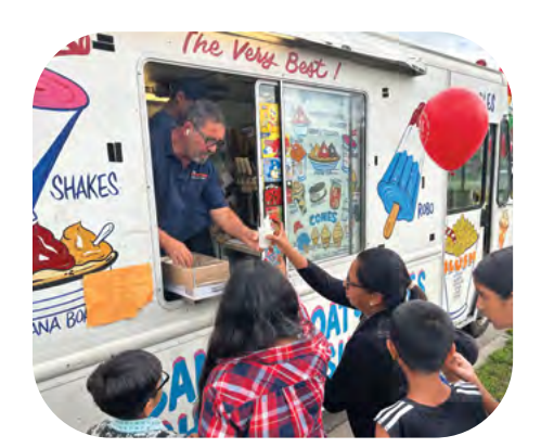
It is always my pleasure to serve the community – including ice cream!