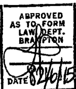
RALPH A. EVERETT - CLERK