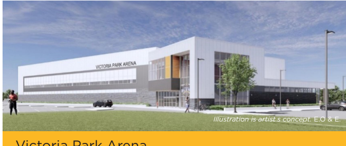
Victoria Park Arena