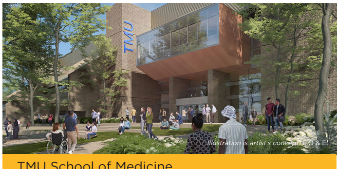
TMU School of Medicine

With help from the province and a $10 million commitment from the City, the new TMU School of Medicine is set to open in 2025. This school and the city's second hospital being built at the former site of Peel Memorial will help address the health care emergency in Brampton and ensure the next generation of health care practitioners train locally. I'm happy to report that we have already set aside $81.1 million in reserves as part of our $125 million commitment towards the second hospital.