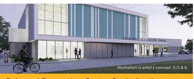
Balmoral Recreation Centre Revitalization