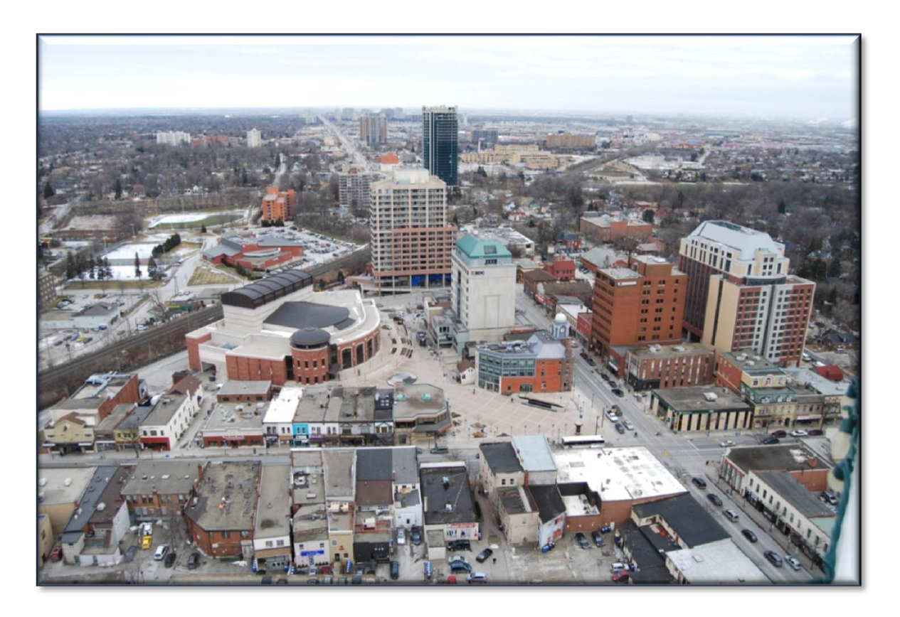
View East of Main Street and Queen Street Corridor (January 2010)

Since 1986, no changes have been made to the SPA to address significant changes in the Provincial and municipal planning regime.