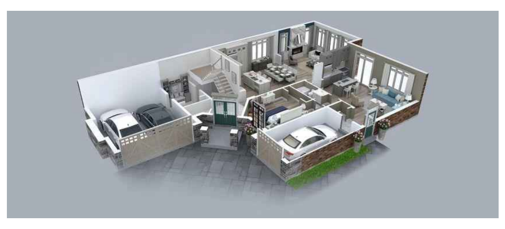
The FlexHouz is built as a bungalow with a 2-storey home on top to support multigenerational living

Marshall Homes is a home-builder that has been building multi-generational homes in Pickering, using a similar model to Lennar's Next Gen Homes. The company has come up with a solution for families with a new take on larger households called the FlexHouz . This is a full size dwelling style that offers the ability for multi-generational families to live together with both financial and practical benefits. The interior of the FlexHouz includes a single-family dwelling with a private self-contained unit on the main floor, which allows the homeowners to use the unit for parents, children or visitors. Both units are designed to be independently customizable which allows for flexibility as household compositions change. The base price of these FlexHouz is at