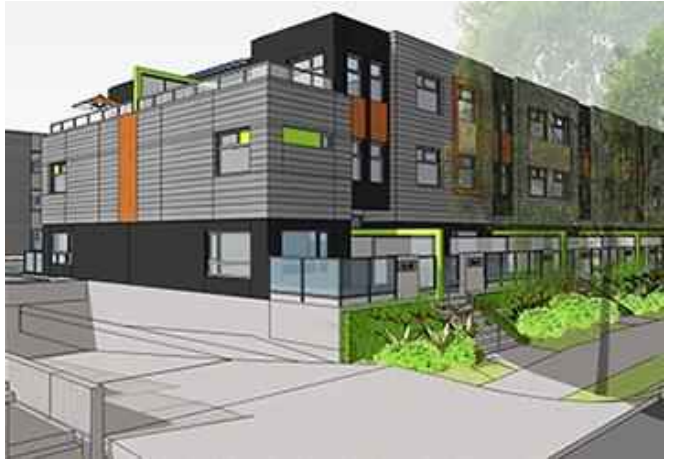
Renderings courtesy of BC Housing