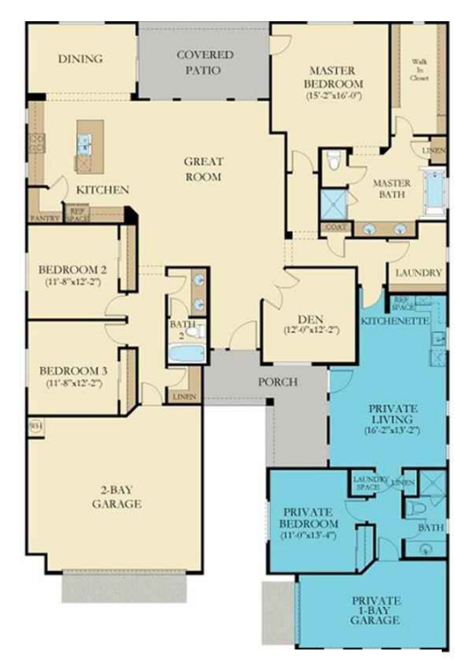
Lennar NextGen Home

The NextGen homes are marketed to demonstrate six different types of potential purchasers, across three different house plans. Photographs of 'typical' families are supported with biographical details to illustrate the different scenarios for living in a multigenerational house. Each family's house plan is shown, marked up with comments about how the space can be configured to be used differently according to their varying needs.