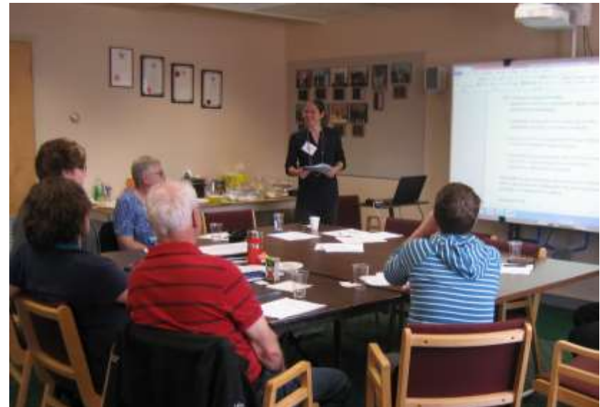
Age-Friendly Committee meetings, County of Frontenac and Dubreuilville