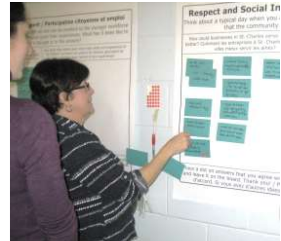
Age-Friendly Expos, Frontenac County, City of North Bay, Municipality of St.-Charles