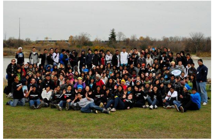
Peel Planet Day Group Shot!

October 30 th served as a day of Environmental Awareness as the Mayor's Youth Team teamed up with youth from all over Peel Region and participated in the first ever Peel Planet Day! This youth-coordinated event that took place at Claireville Conservation Area was developed by students from Volunteering Peel and consisted of a variety of environmental initiatives including planting over 500 trees, a Park Cleanup, building bird houses, and attending environmental workshops from such organizations as Brampton Clean City, Canadian Tire, as well as the Peel Environmental Youth Alliance just to name a few. Special guests such as the Minister of the Environment John Wilkenson attended to speak about the importance of protecting our environment.