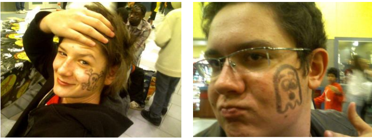
Face painting was one of the many activities offered at this year's Fright Night Events.