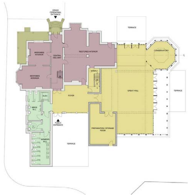
Concept: Ground Floor Plan