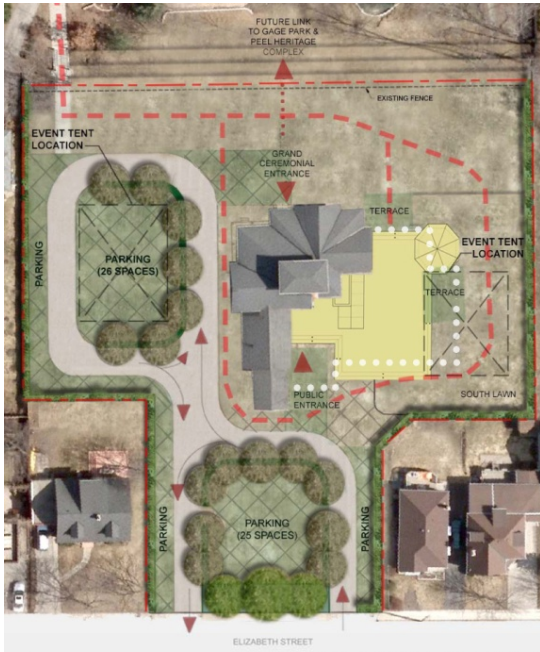
Concept: Site plan