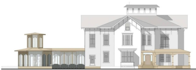
Concept: East Elevation