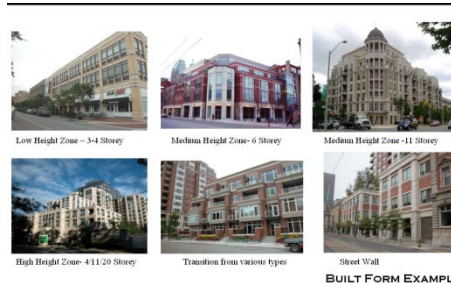
Low Height Zone - 3-4 Storey