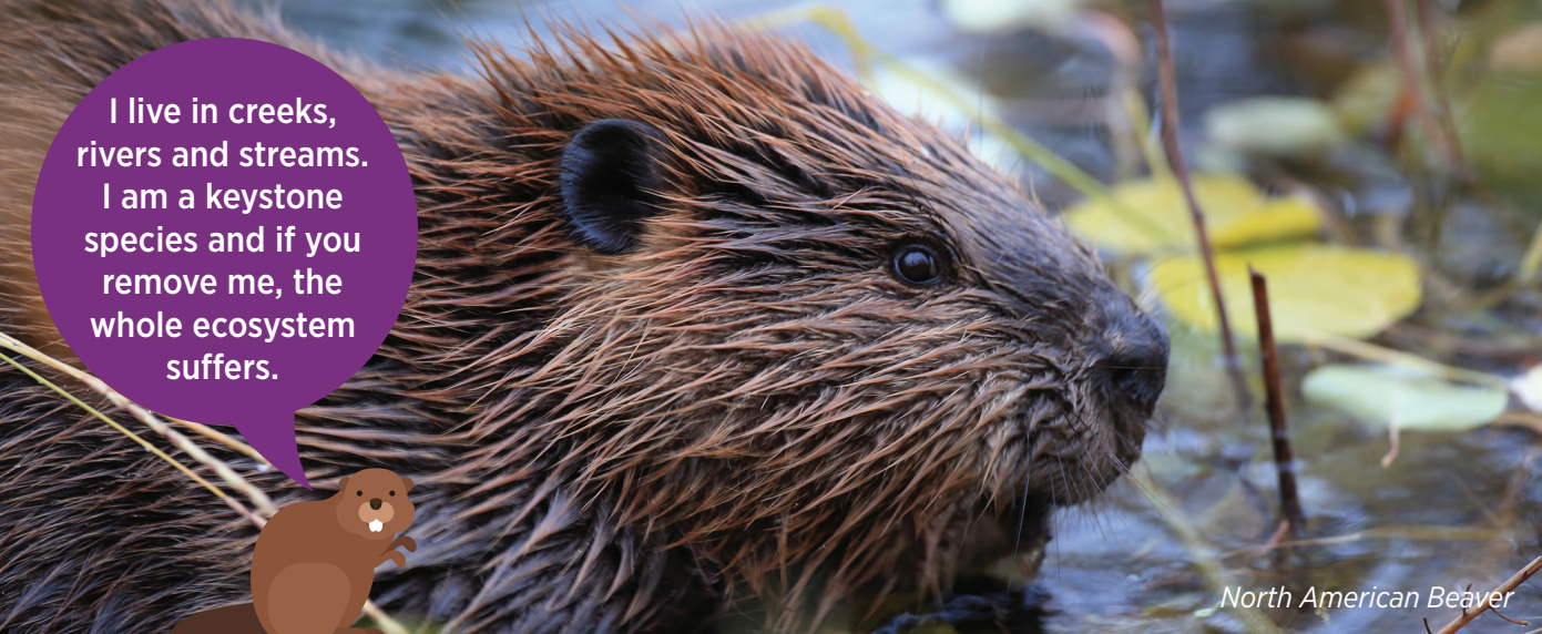
North American Beaver

I live in creeks, rivers and streams. I am a keystone species and if you remove me, the whole ecosystem suffers.