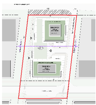
Proposed Site Plan for Phase One

If you have received this notice as an owner of a property and the property contains 7 or more residential units, the City requests that you post this notice in a location that is visible to all the residents, such as on a notice board in the lobby.