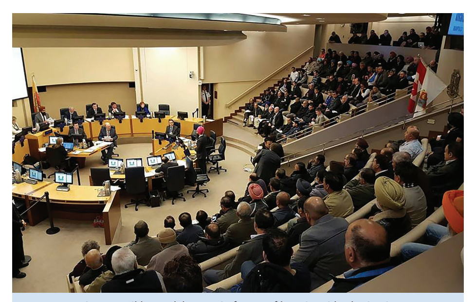
Brampton City Council hears delegates in favour of banning ride-sharing in Brampton.

Until the new By-law is finalized, if you choose to use unlicensed services such as Uber, please exercise caution. Do your research and check about safety, insurance and your rights in the event of an accident or other customer service issue.