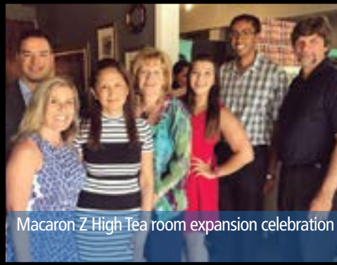
Macaron Z High Tea room expansion celebration