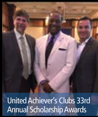
United Achiever's Clubs 33rd Annual Scholarship Awards