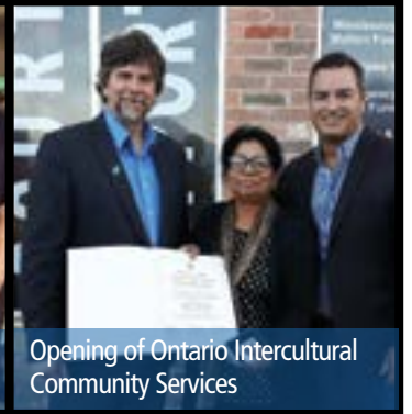
Opening of Ontario Intercultural Community Services

After an extremely busy spring and summer, we turn our attention to the leaves changing in fall and the cold weather of winter! We await the announcement from the Province on a site selection in the downtown for the new University. It will certainly be an impetus for new development, commerce and active transportation, transformational for the downtown corridor.