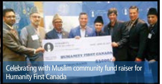
Celebrating with Muslim community fund raiser for Humanity First Canada