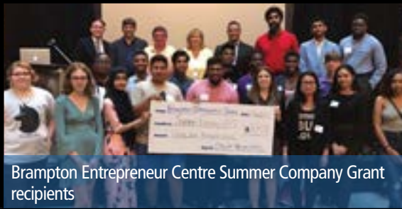
Brampton Entrepreneur Centre Summer Company Grant recipients