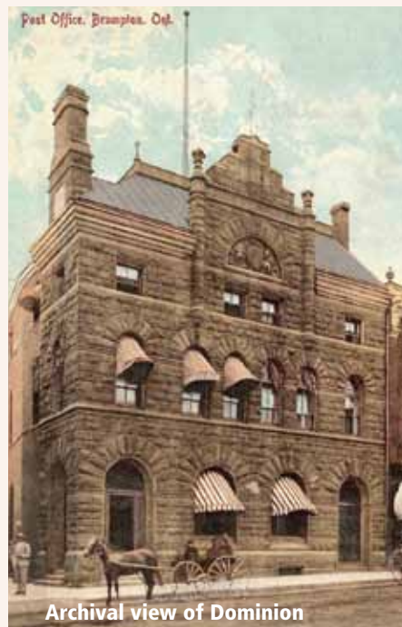
Building, Queen Street East

1. Heritage designation bestows formal public recognition on significant heritage properties with the passing of a municipal by-law. Designation provides clarity as to the cultural importance of a given property. It serves as formal, public recognition that a property has heritage value and