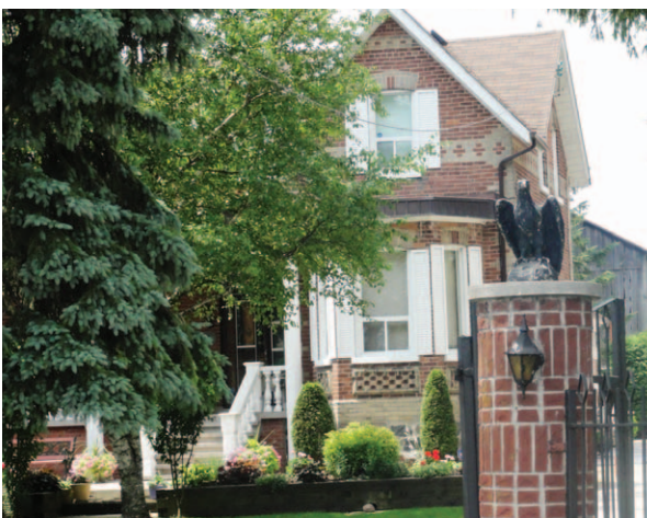
5556 Countryside Drive