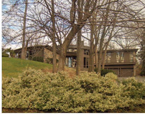
11 Peel Village Parkway