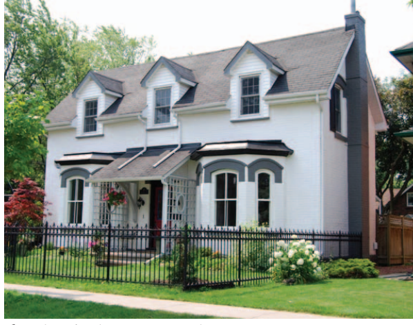
63 Elizabeth Street South