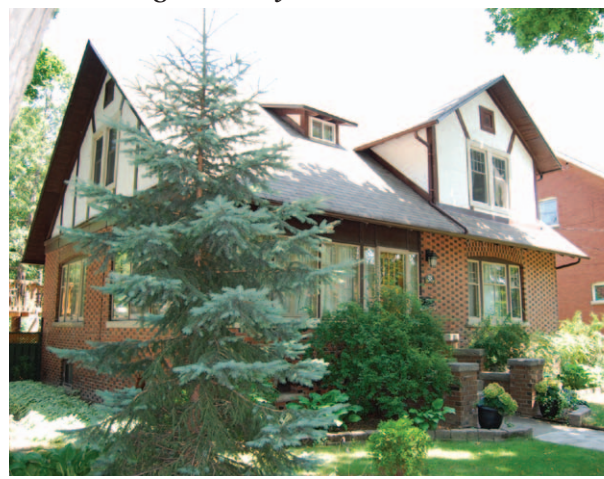
38 Isabella Street