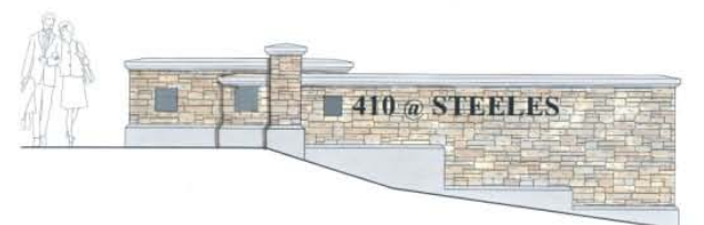
ENTRANCE FEATURE WALL AT BUILDING 'R' - CONCEPT ELEVATION