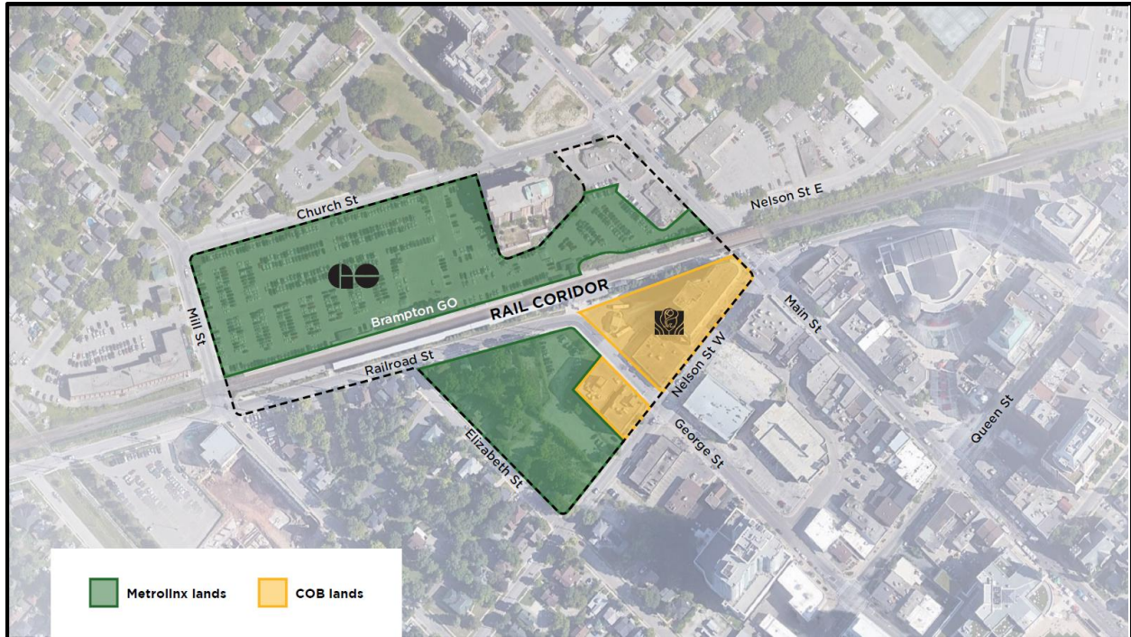
Figure 1: Downtown Transit Hub preliminary Study Area

The graphic in attached Appendix-1 shows key higher order transit projects and initiatives currently under consideration through various plans and studies in addition to the current transit services that will connect the downtown Brampton – as can be seen, the Downtown Transit Hub is a key piece of infrastructure linking regional and local transit services and the following higher order transit project and initiatives: