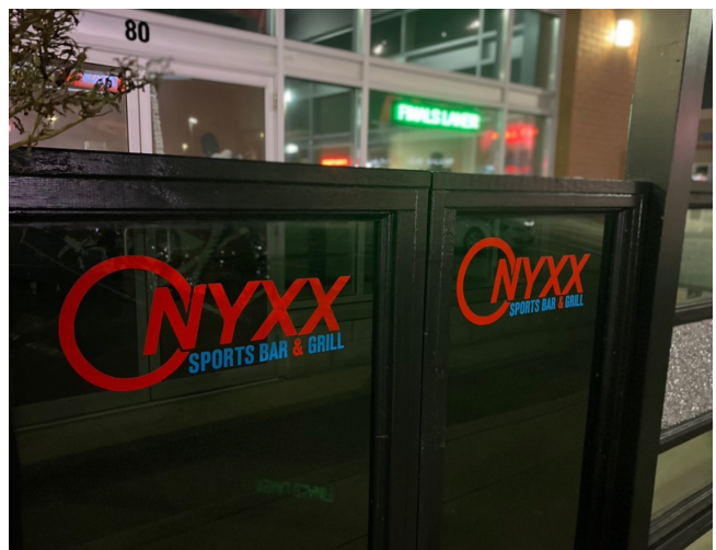
Some examples of Nathan's work